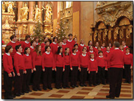
Orlando Deanery Boychoir & Girls Choir in Vienna.

The Orlando Deanery Boychoir and Girls Choir are founded on European models and affiliated with the Royal School of Church Music in England. This music outreach program of the Cathedral Church of St. Luke in downtown Orlando serves the community, nation & world. Creating beautiful music of the highest standards, the choirs develop musicianship, vocal skills, teamwork, responsibility, leadership, courtesy, respect for other cultures, poise and professionalism. Performances include civic festivals, opera and symphony, charity concerts, private parties, weddings, religious services, conventions, TV commercials and Disney events, often with prominent local orchestras.